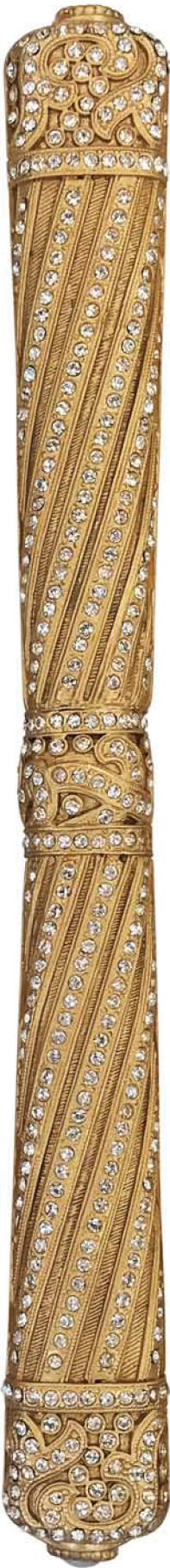
10340SG CC = 6" L = 8-1/4" P = 1-5/8"