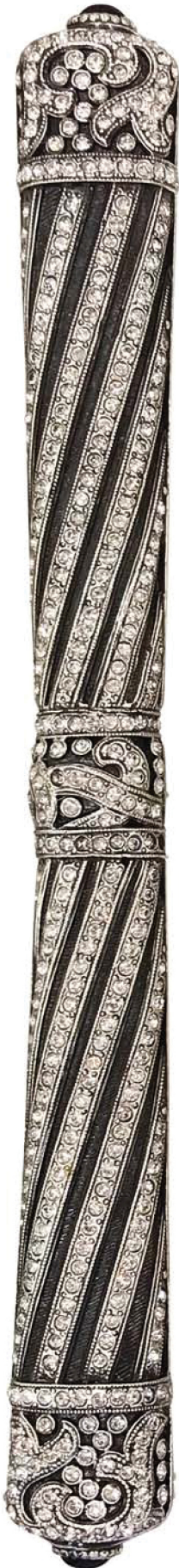
10340BS CC = 6" L = 8-1/4" P = 1-5/8"