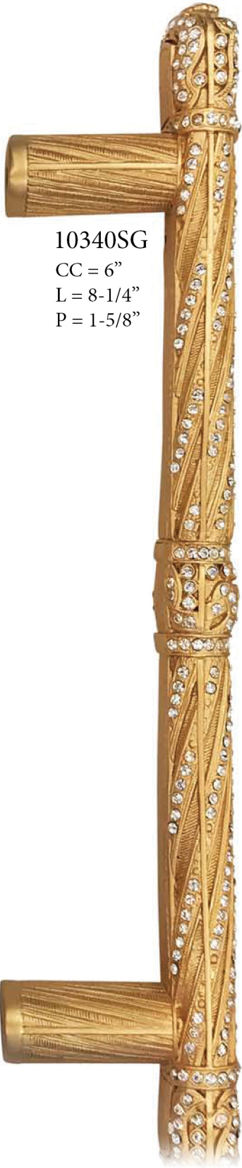
10340SG CC = 6" L = 8-1/4" P = 1-5/8"