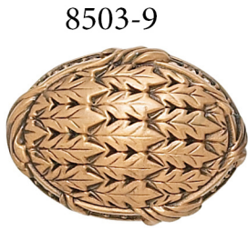
D = 1-1/16" x 1-7/16" P = 1"