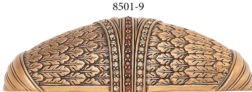
CC = 3-1/2" L = 4-1/4" P = 15/16"