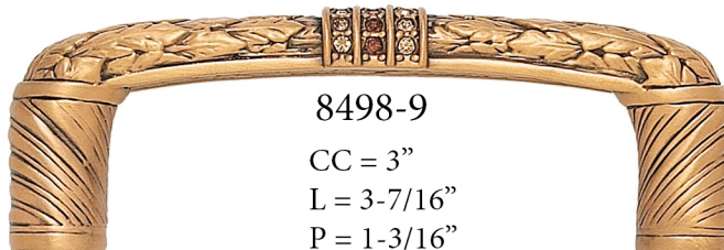
CC = 3" L = 3-7/16" P = 1-3/16"