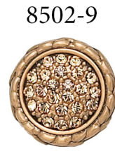
D = 13/18" P = 13/18"